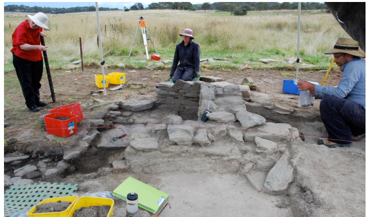
At the Googong Dig 22 February 2012