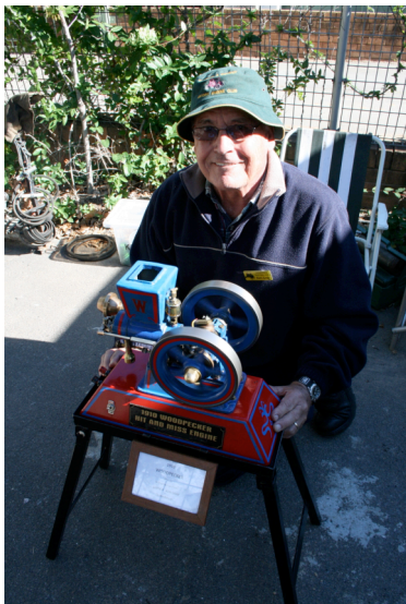
Canberra & District Historic Engine Club