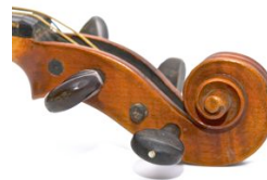
Right: Four objects from our 45 Pieces of Queanbeyan On Line Exhibition: Monk Fiddle Victoria Hotel Mantel Dogs Wrights Store Journal Wilcox & Gibbs Sewing Machine