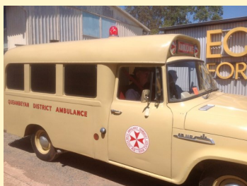
Queanbeyan Ambulance at Temora Rural Museum Open Day