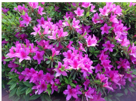
Museum garden is looking wonderful