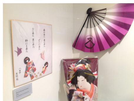
Detail of Sister City display from A Good Neighbour