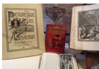
Museum at St Clement's Fascinating History!