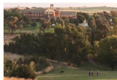
St Clement's Monastery Galong NSW Beautiful rural location