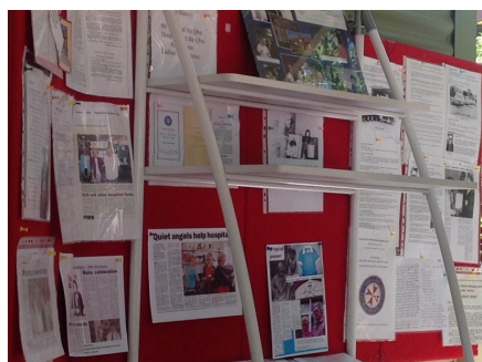
New Display for Ambulance and Hospital Auxiliary See it in Museum foyer